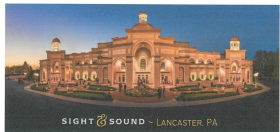
SIGHT & SOUND ~ LANCASTER, PA

See Holy Name Society Event Table in the Auditorium